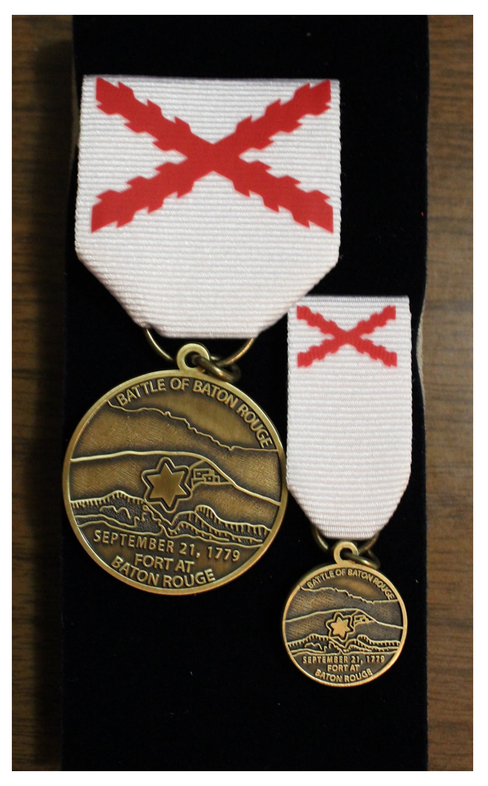
http://lassar.org/uploads/3/4/3/4/34343076/galvez medal revised jul2023.pdf